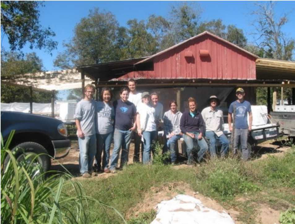
Fall Workshare Crew

8) CSA Work-share Volunteers for Winter Session?